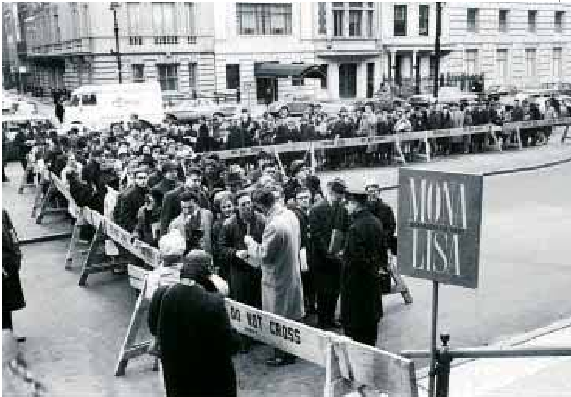
Right: 'Mona mania' hits New York's Metropolitan Museum of Art in 1963